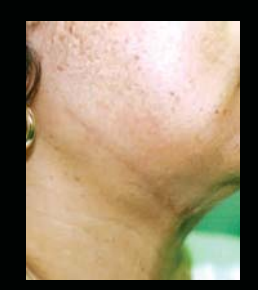
6 week NewGel+ Treatment

CE & FDA Approved for Scar Management www.newgel.co.uk