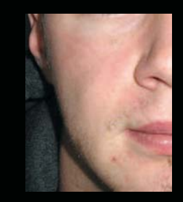
12 week NewGel+ Treatment